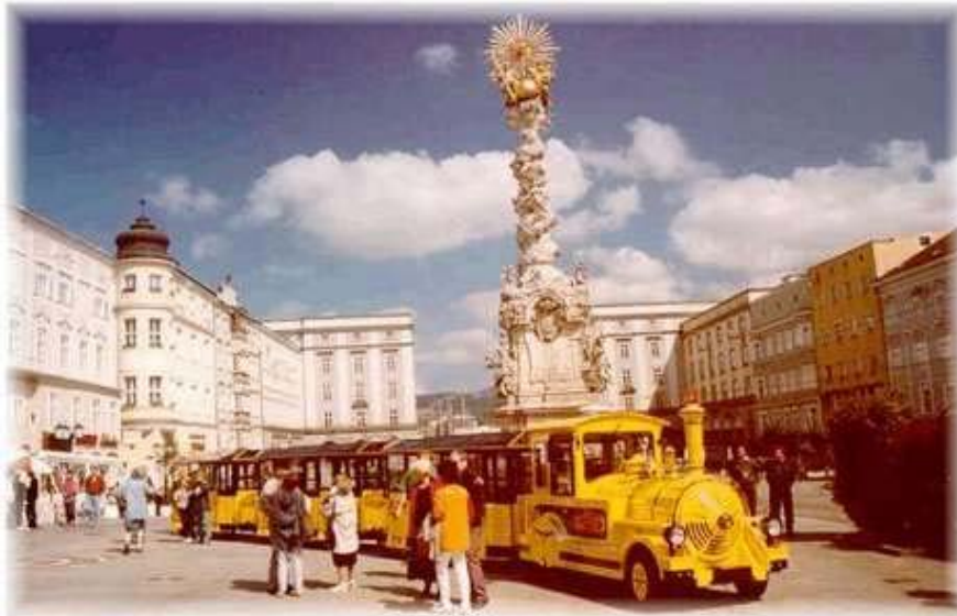
The famous monument behind the yellow train, reminds of the black disease in the middle ages.

Further information under http://www.linz.at